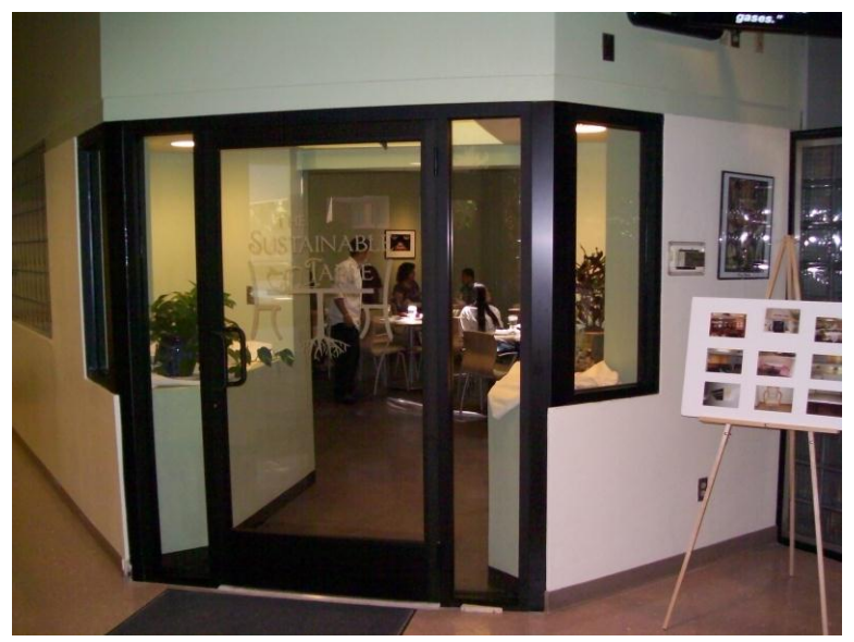
Business management + entrepreneurship