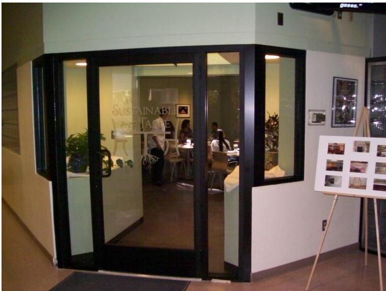
Business management + entrepreneurship