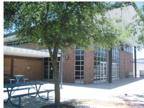
Community + Civic Engagement