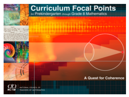
NCTM — www.nctm.org

http://corestandards.org/ http://commoncoretools.wordpress.com/